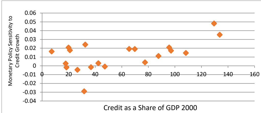
Figure 2. Central Bank Credit Sensitivity to Credit Growth and Credit Share in GDP

Notes: This figure depicts the country-specific coefficients on real credit growth in Table 7 on y-axis and the credit to GDP (of year 2000) ratio of respective countries in x-axis. A simple regression of the monetary policy sensitivity of credit growth on the credit- GDP ratio gives R-square of 0.28.